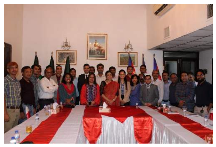
(The Embassy officials with the members of DCAB)

diplomatic correspondents in promoting Nepal-Bangladesh relations and appreciated their support and cooperation.