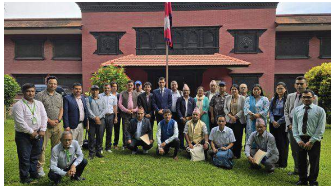
(Embassy officials with the delegation of MoALD of Nepal)

The Embassy welcomed a delegation led by the Ministry of Agriculture and Livestock Development (MoALD) of Nepal.