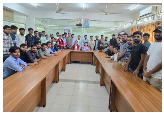
(Embassy officials with Nepali students at HSTU in Dinajpur)

The Embassy team visited Hajee Mohammad Danesh Science and Technology University (HSTU) in Dinajpur and had an interaction with university officials and Nepali students studying there.