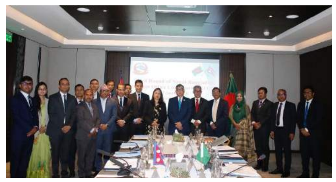
(Delegations of Nepal and Bangladesh during the 3<sup>rd</sup> FOC)

to enhance cooperation in regional and sub-regional frameworks including the SAARC, BIMSTEC, and BBIN, among others. They also agreed to work together at various multilateral forums, especially at the UN to pursue common interests in the areas of LDC graduation, poverty alleviation, climate change and safety and security of migrant workers.