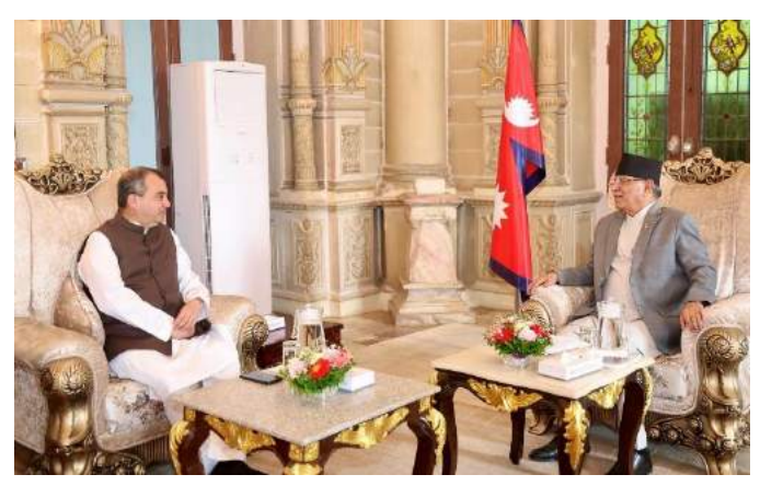
(Minister Mr. Chowdhury calls on the Rt. Hon. PM of Nepal)

Discussion was also focused on exploring opportunities for collaboration on various environmental initiatives.