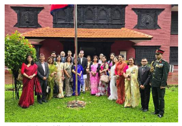
(Embassy Officials with Nepali community in Dhaka)

people including the promulgation of Constitution in 2015.