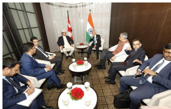
(Foreign Minister in a meeting with External Affairs Minister of India)