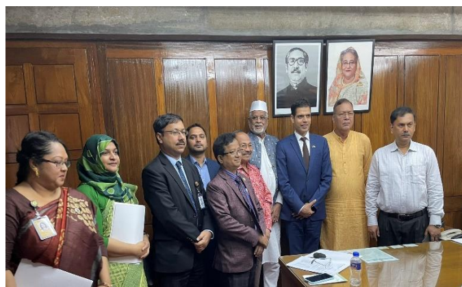
(Ambassador with the Members of Bangladesh-Nepal Parliamentary Friendship group)

The Ambassador thanked the Chairman and members of the Friendship Group for their goodwill and cooperation towards enhancing Nepal-Bangladesh relations and expressed his commitment to facilitate further parliamentary exchanges between the two countries.