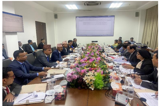
(Delegates from Nepal and Bangladesh during the Energy Secretary-level meeting in Patuakhali, Barishal)