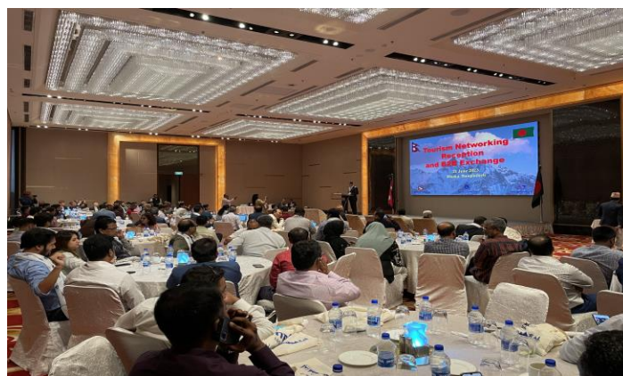
(Participants at the event)

The Programme was attended by over 140 participants, including officials from Government of Bangladesh, representatives of travel agencies, tour operators, hotels and airlines, and other hospitality, travel, and tourism-related organizations of Bangladesh.