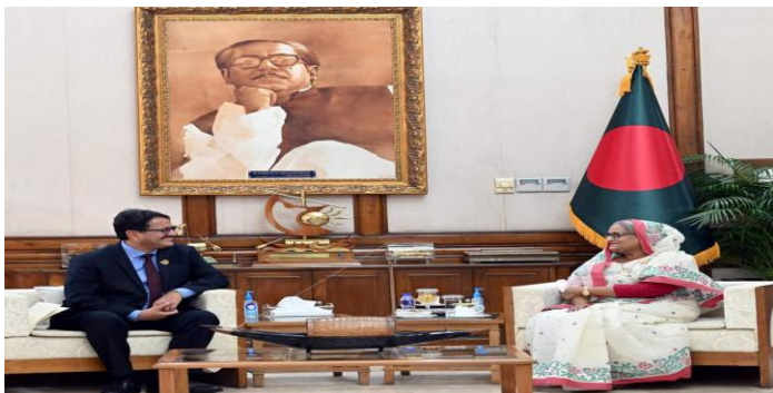
(Foreign Minister with Prime Minister H.E. Sheikh Hasina)

On 14 May, the Foreign Minister called on the Prime Minister of Bangladesh H.E. Sheikh Hasina. During the meeting, various aspects of Nepal-Bangladesh relations were reviewed, and the leaders agreed to work together to enhance cooperation in areas of trade, transit, investment, energy, education, and people-to-people exchanges, among others.