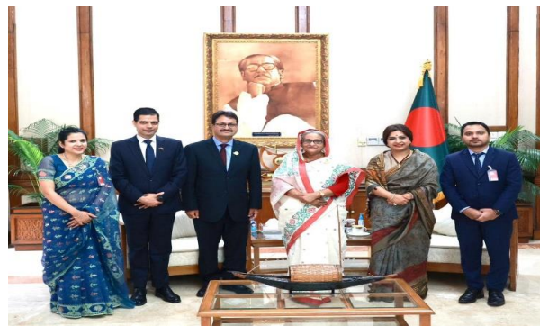
(Foreign Minister and his delegation with Prime Minister of Bangladesh)

Foreign Minister had a virtual meeting with Dr. A. K. Abdul Momen, Minister for Foreign Affairs of Bangladesh on 12 May. On the same day he also attended the inaugural session of the 6th Indian Ocean Conference followed by Cultural Soirée and Dinner hosted by the Prime Minister of Bangladesh H.E. Sheikh Hasina in honour of the visiting heads of delegations. President of Mauritius, Vice President of the Maldives and visiting ministers were among the attendees in the inaugural session.