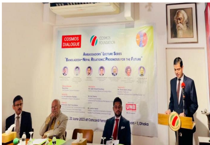
(Ambassador delivering his lecture during the event)