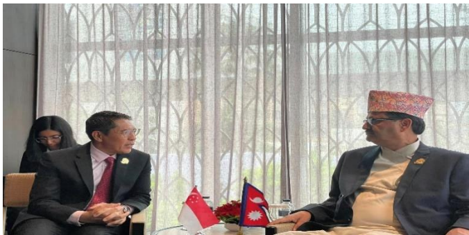
(Foreign Minister with Second Minister for Foreign Affairs of Singapore)

Upon completion of his three-day visit to Bangladesh, the Foreign Minister departed for Kathmandu on 14 May.