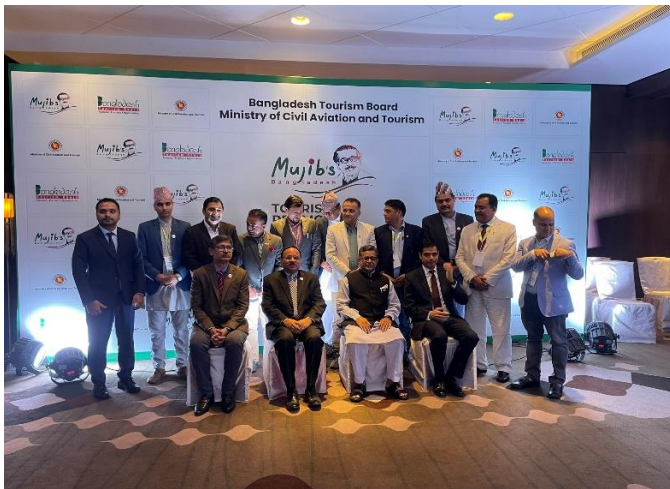
(Nepali delegation with Hon. State Minister for Culture and Tourism of Bangladesh during the event)

A nine-member Nepali delegation consisting of officials of Nepal Tourism Board (NTB) and entrepreneurs representing from tourism and hospitality organizations from Nepal visited Dhaka to participate in the Mujib's Bangladesh Tourism Promotion and B2B Exchange organized by Bangladesh Tourism Board in collaboration with the Ministry of Culture and Tourism of Bangladesh on 26-29 May 2023.