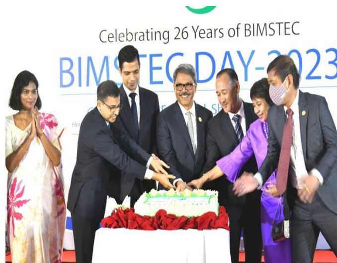
(Ambassadors of BIMSTEC member countries joined with the State Minister for Foreign Affairs of Bangladesh and BIMSTEC Secretary General during the BIMSTEC Day celebration)