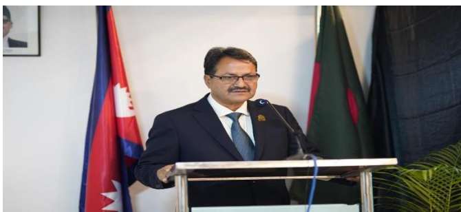
(Foreign Minister addressing the event on energy cooperation) (Click on the image to watch the full video)

On the occasion of the Minister for Foreign Affairs Hon. Mr. Narayan Prakash Saud's visit to Bangladesh, the Embassy organized an event on 'Realizing Energy Cooperation between Nepal and Bangladesh' on 13 May. The event was organized with a view to promoting dialogue among key stakeholders and fostering collaboration in the energy sector between the two countries.