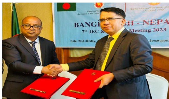
(Secretaries during the signing of the MoU)

The two secretaries also signed a memorandum of understanding (MoU) between Nepal and Bangladesh on 'Sharing of Real-time Hydro-meteorological Data and Information for Flood Forecasting and Warning'. The MoU is expected to facilitate the smooth exchange of hydro-meteorological data during monsoon and extreme weather conditions.