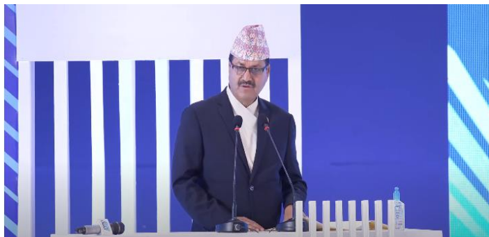
(Hon. FM delivering his remarks at the IOC 2023)

Minister for Foreign Affairs Hon. Mr. Narayan Prakash Saud visited Bangladesh from 12-14 May 2023 to attend the 6th Indian Ocean Conference held in Dhaka on 12-13 May. While in Dhaka, the Foreign Minister addressed the Conference on 13 May. He underscored the strategic, economic, and ecological significance of the Indian Ocean and highlighted its importance as a gateway to international markets for landlocked countries like Nepal.