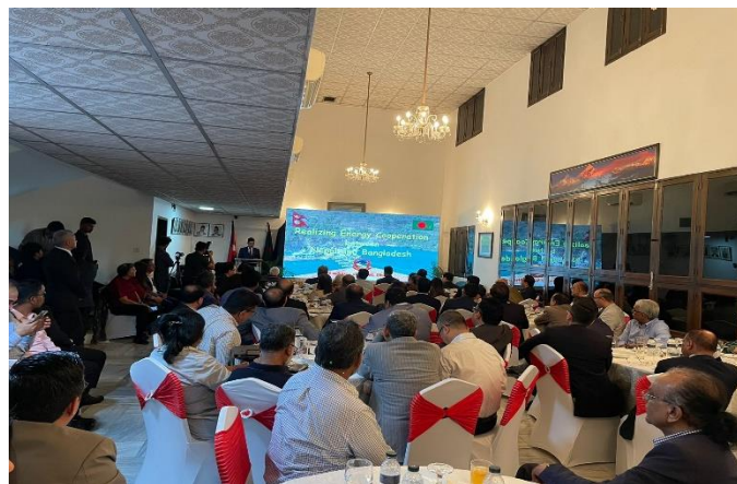
(Participants of the event on realizing energy potential)

Ambassador Mr. Ghanshyam Bhandari highlighted the significance of strengthening energy cooperation for the economic advancement and sustainable development of both countries.